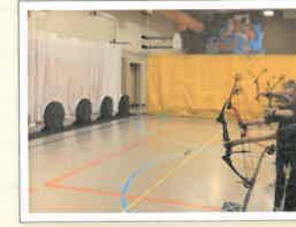
ARCHERY IN ACTION