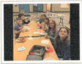
PIZZA WITH THE PRINCIPAL