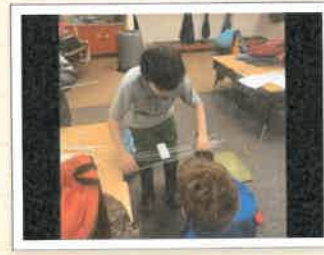
SCIENCE OLYMPIAD RESEARCH AND DEVELOPMENT