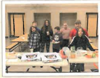
PIZZA WITH THE PRINCIPAL