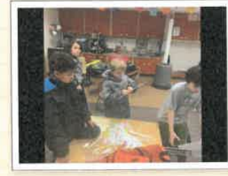
SCIENCE OLYMPIAD RESEARCH AND DEVELOPMENT