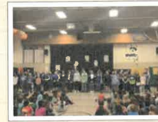
PJMS/PHS BAND AND CHOIR CONCERT