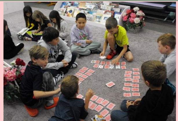
Brain Break Time never takes a break!