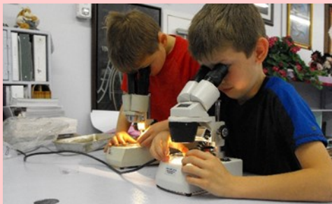
Forensic science says it was the screw!