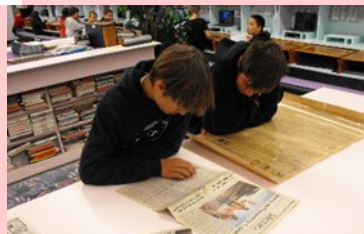
Collaborating on a compare-contrast 5-paragraph essay on newspapers from the Post-Civil War era and the 21 st Century.