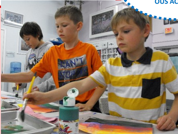
The Valley sunset comes alive with a touch of paint.

MRS. BRADY'S STUDENTS LEARN THROUGH VARI- OUS ACTIVITIES