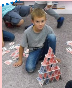
Our future house builder proves a point.