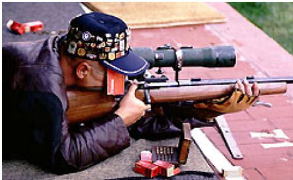
U. S. Army rifle shooter Lones Wigger is one of the all-time greats. He won two Olympic gold medals, two World Championships and dozens of other international medals.

(2004). Another important milestone in the history of marksmanship occurred in 1976 when Margaret Thompson-Murdock of the U.S. won a silver medal to become the first woman to ever win an Olympic medal in shooting. The U.S. Army Marksmanship Unit trained Murdock, Writer, Bassham, and Etzel.