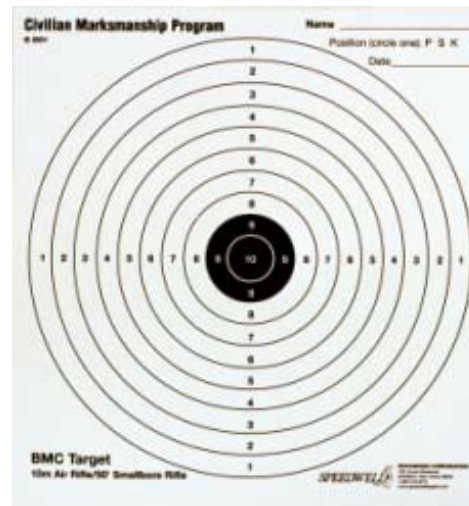
The most common targets today are paper targets with scoring rings that have values from one to ten. Shots hitting the center ring score ten points, shots hitting the next ring score nine points, etc.

originally were intended to prepare men for battle. Target sports have a strong military heritage and target training is sometimes practiced as part of modern military or police training. Today, however, target rifle shooting is primarily practiced as a sport in the same way that basketball, swimming, running and skiing are sports. All sports have special qualities that make them unique. Target shooting participants need to know about some of its special qualities.