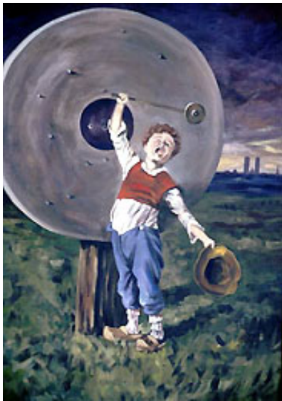
Rifle targets in seventeenth and eighteenth century Europe were large wooden disks that were fired at from distances of as much as 400 meters. The young boy was called a “Scheibentoni” or target marker.

The targets used today have concentric scoring rings. Shots that touch the central or inner ring score ten points. Shots that hit the next ring score nine points. Successively poorer shots score values down to one or even zero.