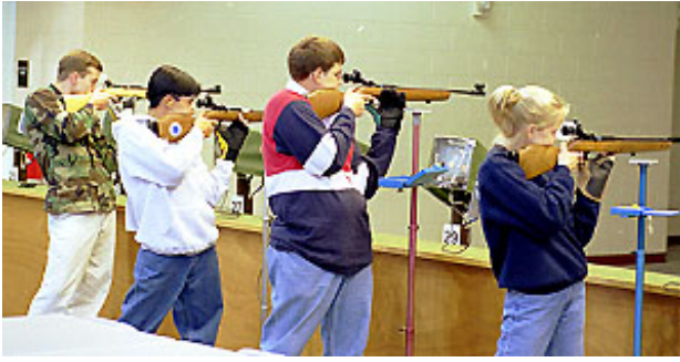
JROTC cadets are shown firing at 10-meter targets in the standing position in a sporter class three-position air rifle competition.