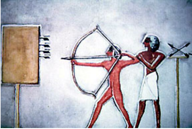
Targets used in Ancient Egypt 4,000 years ago were simple boxes or cylinders.